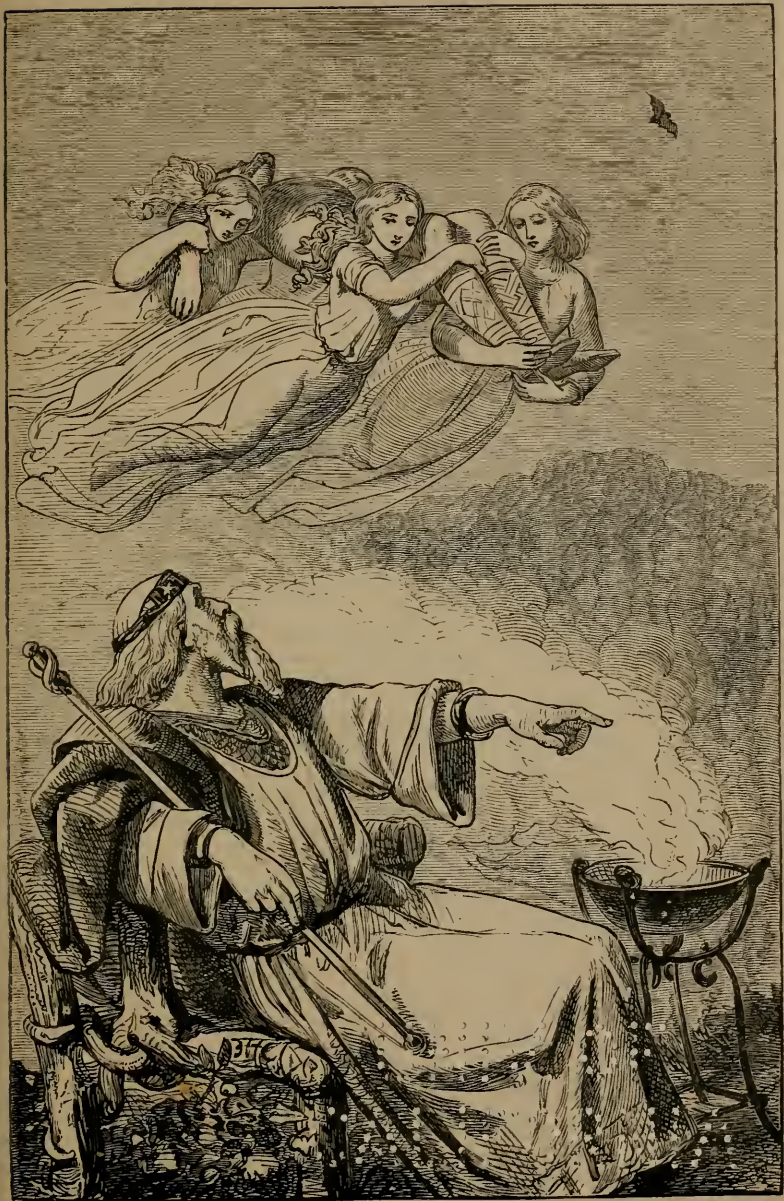
St. David of Wales.